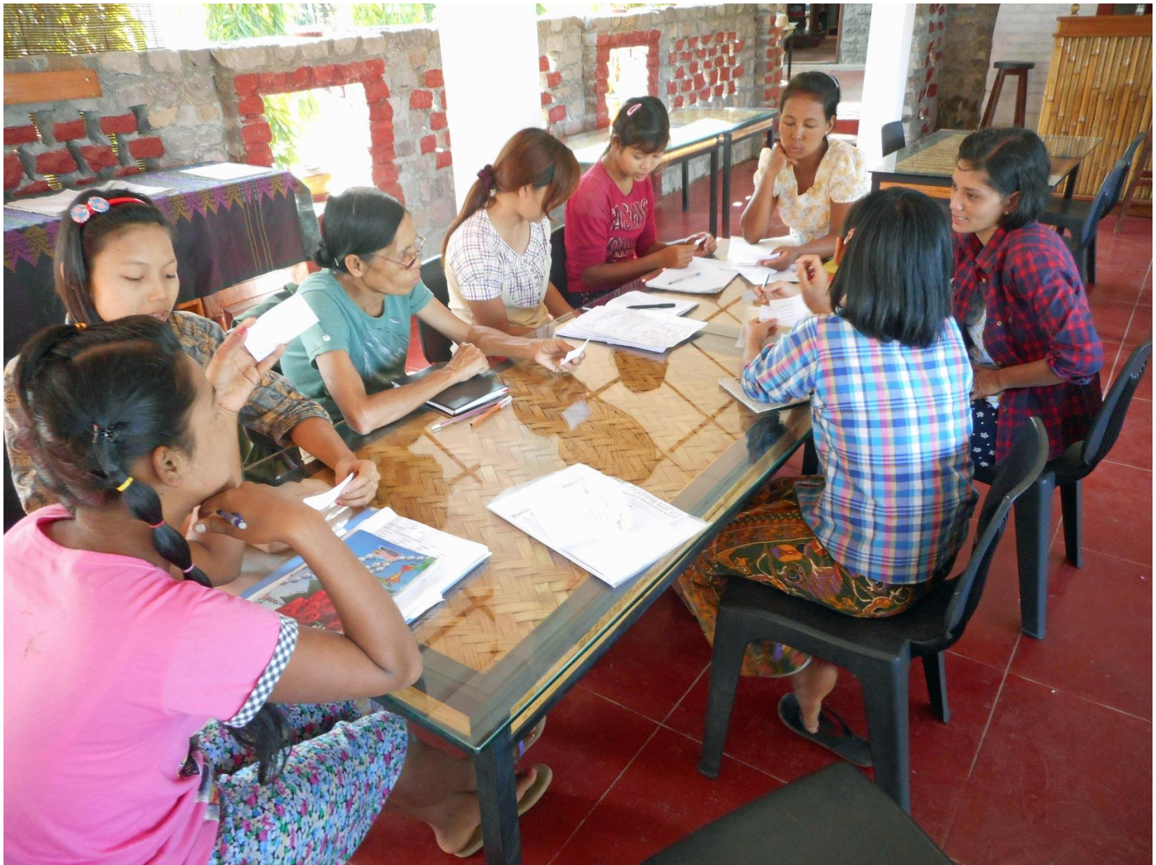
English lesson for the hotel staff