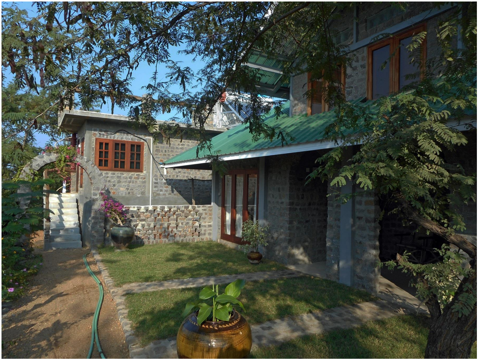
The latest rooms