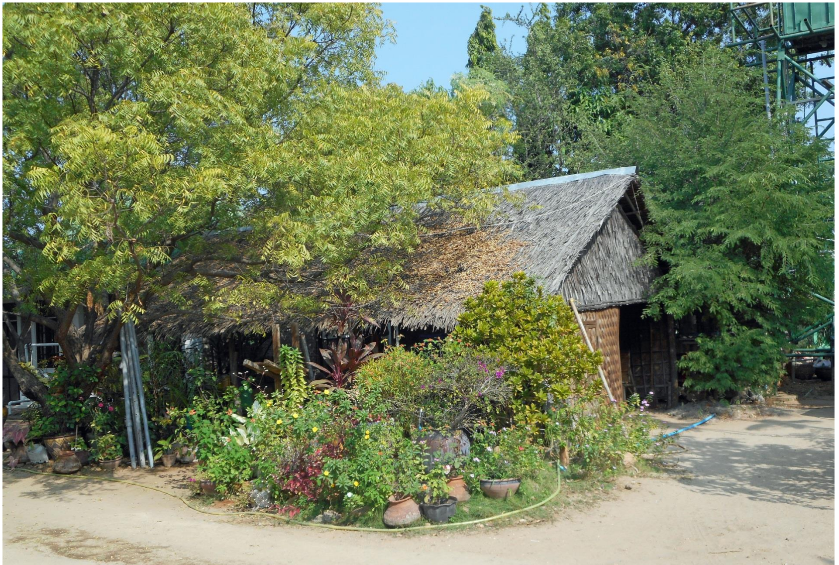
The old dining room