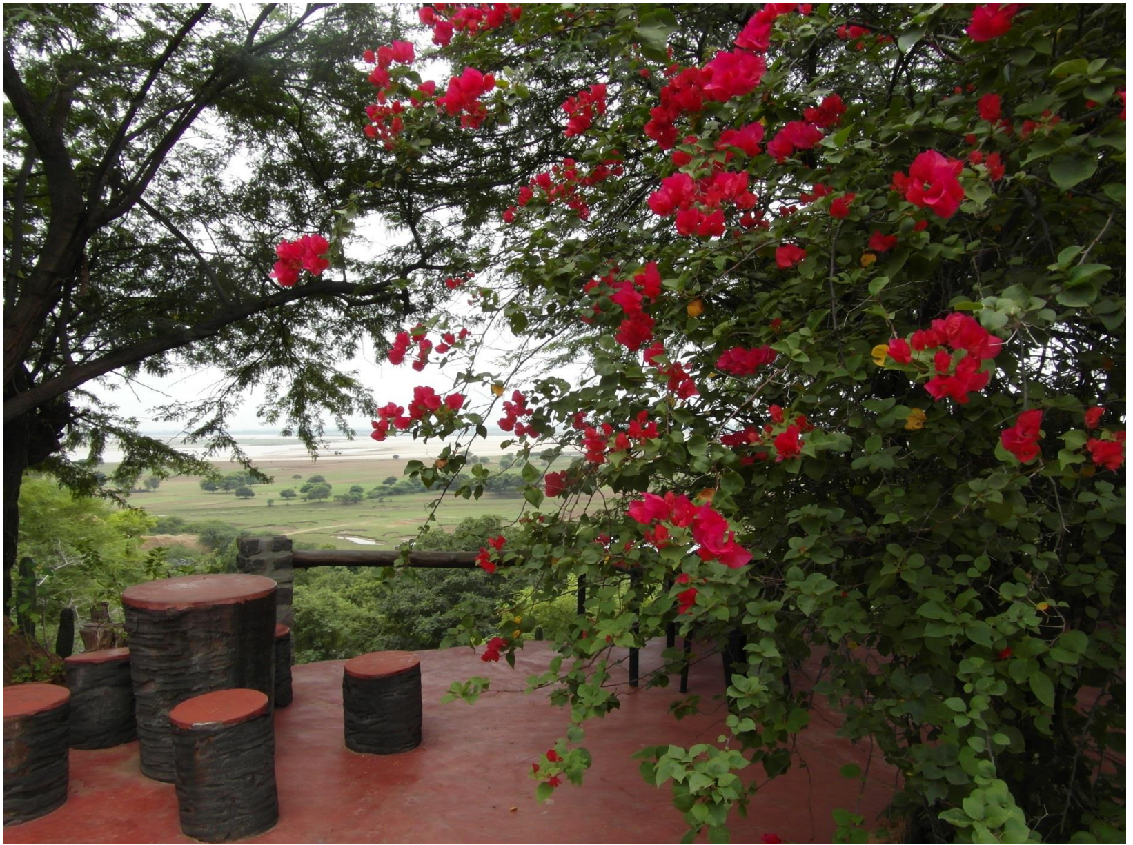
View from the terrace to the Irrawadi river