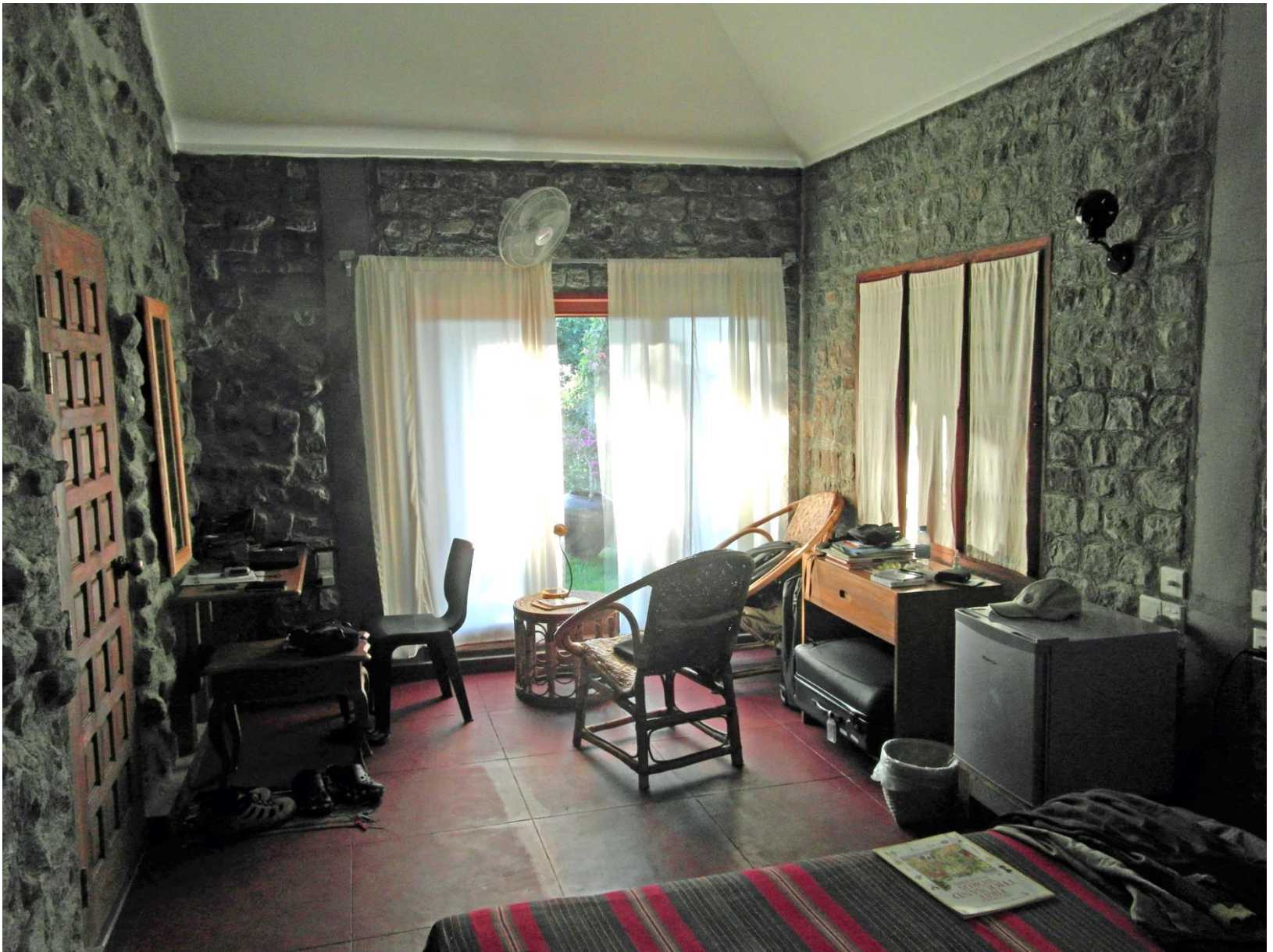
Room no. 14