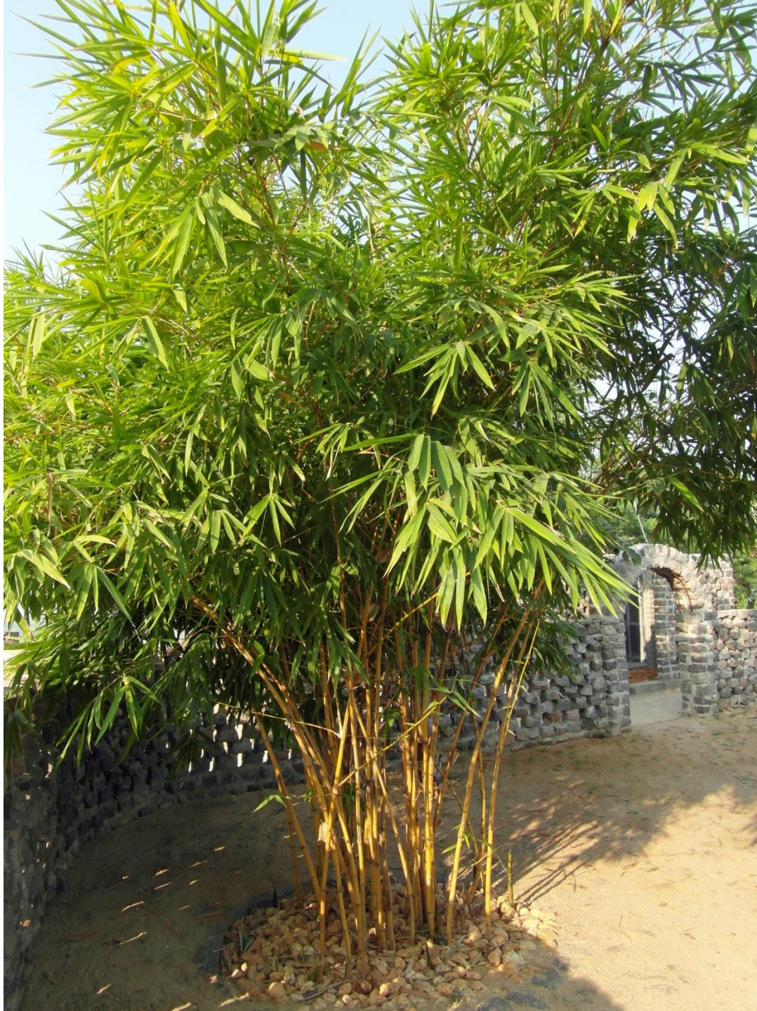
Young bamboo bush